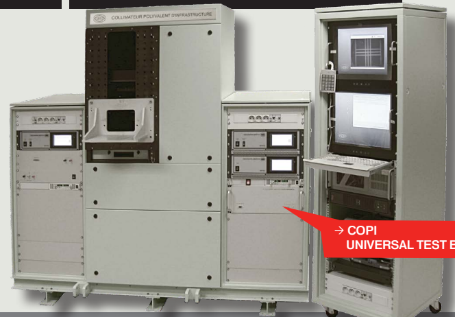
→ COPI UNIVERSAL TEST BENCH