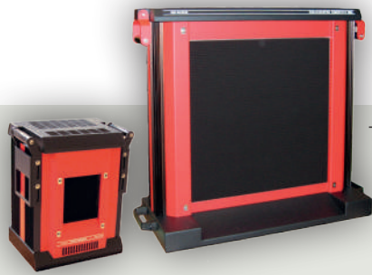
→ ECN 100 H6 &amp; N20