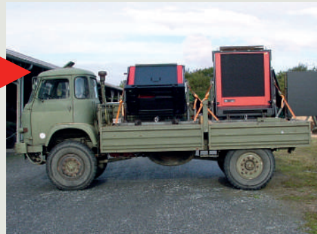
→ ECN 100 N40