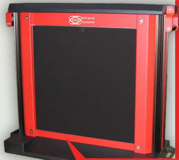
→ ECN 100 Extended area blackbody

The robust structure of the emissive head enables lab or field condition operation. Besides, the external mechanical parts are maintained to temperatures below 50°C, thus preserving safe operation.