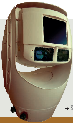
→ SPYNEL-S with V-LRF option