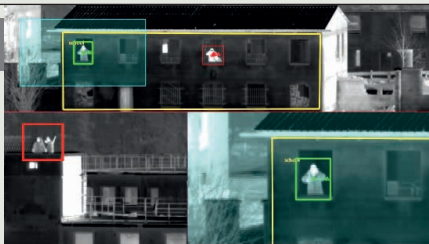
→ Simultaneous multi-target tracking