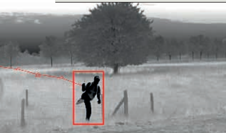
→ SPYNEL night&day intrusion detection