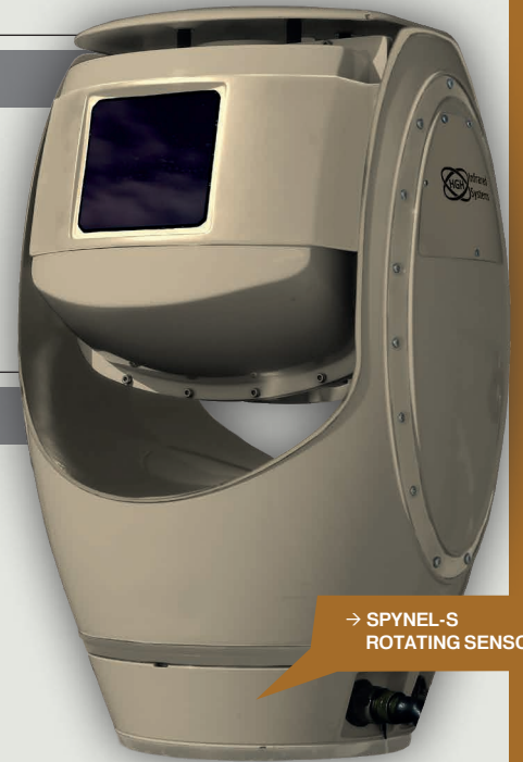
→ SPYNEL-S ROTATING SENSOR

Compact and robust, Spynel can be quickly deployed to perform multi-events detection over extremely large areas in total darkness, fog, smoke. An unlimited number of tracks are immediately recognized in highly resolved images, including hardly detectable threats, such as small, slow or tangentially moving targets. It can be used as a reliable and cost-effective standalone perimeter security solution as well as an added layer of capability to systems already in place.