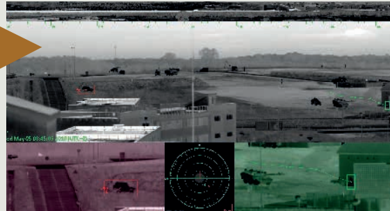
→ SPYNEL persistent situational awareness